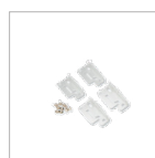
Wall mounting kit LKITA00000000026