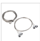
Suspension kit LKITA00000000022