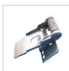
Drywall recessed springs LKITA00000000023