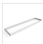
Ceiling frame (295x1195) LKITA00000000091