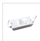
Emergency Kit LKITA00000000086