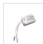
Driver DALI LKITA00000000087