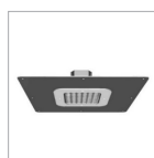
Adapter plate 50x50 Code: on request