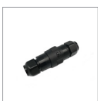
Fast connector IP 2 poles LKITA00000000017