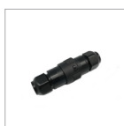
Fast connector IP 3 poles LKITA00000000003