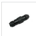
Fast connector IP 3 poles LKITA00000000003