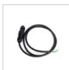
Cable with connector Ca. 2 m., Con 2 poles LKITA00000000040 Ca. 2 m., Con 3 poles LKITA00000000041