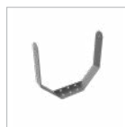
Bracket Kit Galvanised iron LKITA00000000043 Inox LKITA00000000044