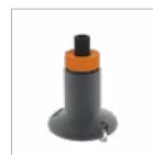
Laser pointer support kit LKITA00000000093