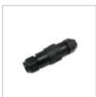
Fast connector IP 2 poles LKITA00000000017