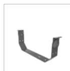
Wall bracket kit LKITA00000000062