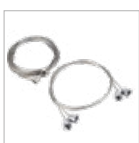
Suspension kit LKITA00000000022