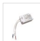
Driver DALI LKITA00000000087