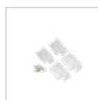
Wall mounting kit LKITA00000000026