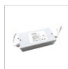
Emergency Kit LKITA00000000086