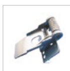
Drywall recessed springs LKITA00000000023