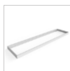
Ceiling frame (295x1195) LKITA00000000025