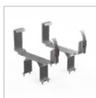
Connection kit for slotted cable trays 200 mm LKITA00000000008