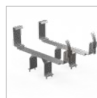
Connection kit for slotted cable trays 300 mm LKITA00000000009