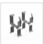
Connection kit for slotted cable trays 100 mm LKITA00000000007