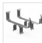
Connection kit for slotted cable trays 300 mm LKITA00000000009