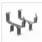
Connection kit for slotted cable trays 200 mm LKITA00000000008