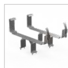
Connection kit for slotted cable trays 300 mm LKITA00000000009