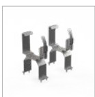
Connection kit for slotted cable trays 100 mm LKITA00000000007