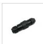
Fast connector IP 3 poles LKITA00000000003