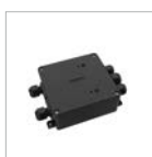
Junction box kit LKITA00000100021