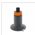
Laser pointer support kit LKITA00000000093