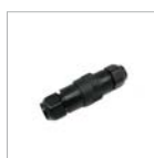
Fast connector IP 2 poles LKITA00000000017