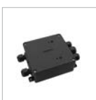
Junction box kit LKITA00000100021