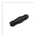
Fast connector IP 3 poles LKITA00000000003