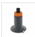
Laser pointer support kit LKITA00000000093