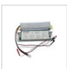
Emergency kit LKITA00000000083