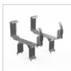
Connection kit for slotted cable trays 200 mm LKITA00000000011