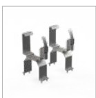
Connection kit for slotted cable trays 100 mm LKITA00000000010