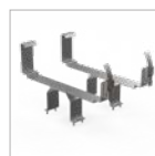
Connection kit for slotted cable trays 300 mm LKITA00000000012