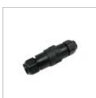
Fast connector IP 2 poles LKITA00000000017