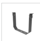
Wall/ Ceiling kit LKITA00000000016