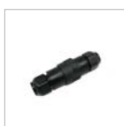
Fast connector IP 3 poles LKITA00000000003