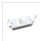
Emergency Kit LKITA00000000095