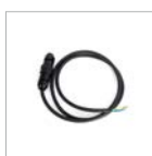
Cable with connector LKITA00000000040 LKITA00000000041