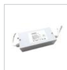
Emergency Kit LKITA00000000095