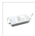
Emergency Kit LKITA00000000095