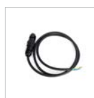
Cable with connector LKITA00000000040 LKITA00000000041