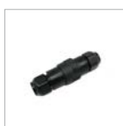
Fast connector IP 3 poles LKITA00000000003