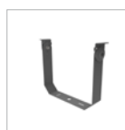
Wall/ Ceiling kit LKITA00000000016