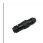
Fast connector IP 5 poles LKITA00000000103