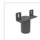
Pole mounting bracket LKITA00000000002