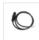
Cable with connector Ca. 2 m., Con 2 poles LKITA00000000040 Ca. 2 m., Con 3 poles LKITA00000000041