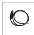
Cable with connector Ca. 2 m., Con 2 poles LKITA00000000040 Ca. 2 m., Con 3 poles LKITA00000000041