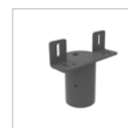
Pole mounting bracket LKITA00000000002