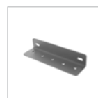
90° Bracket kit LKITA000000000020