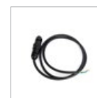
Cable with connector Ca. 2 m., Con 2 poles LKITA00000000040 Ca. 2 m., Con 3 poles LKITA00000000041