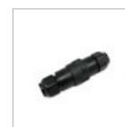
Fast connector IP 5 poles LKITA00000000103