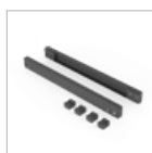
Modules assembly kit LKITA0000000005