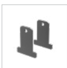
Suspension Kit LKITA0000000004