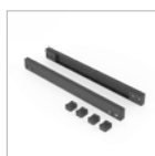
Modules assembly kit LKITA00000000005