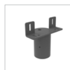
Pole mounting bracket LKITA00000000002