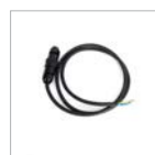
Cable with connector Ca. 2 m., Con 2 poles LKITA00000000040 Ca. 2 m., Con 3 poles LKITA00000000041