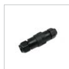
Fast connector IP 2 poles LKITA00000000017