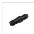
Fast connector IP 5 poles LKITA00000000103