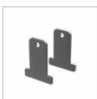
Suspension Kit LKITA00000000004