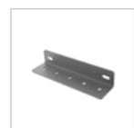
90° Bracket kit LKITA00000000020