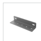
90° Bracket kit LKITA00000000020