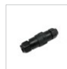
Fast connector IP 5 poles LKITA00000000103