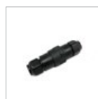
Fast connector IP 2 poles LKITA00000000017