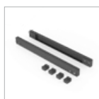
Modules assembly kit LKITA00000000005