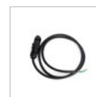
Cable with connector Ca. 2 m., Con 2 poles LKITA00000000040 Ca. 2 m., Con 3 poles LKITA00000000041