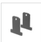
Suspension Kit LKITA00000000004