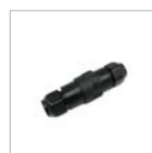
Fast connector IP 5 poles LKITA000000000103