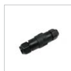
Fast connector IP 2 poles LKITA000000000017