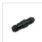
Fast connector IP 3 poles LKITA000000000003