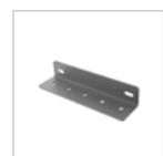
90° Bracket kit LKITA000000000020