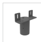
Pole mounting bracket LKITA000000000002