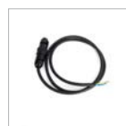
Cable with connector Ca. 2 m., Con 2 poles LKITA000000000040 Ca. 2 m., Con 3 poles LKITA000000000041