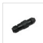
Fast connector IP 3 poles LKITA00000000003