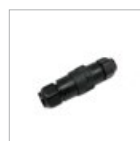
Fast connector IP 5 poles LKITA00000000103