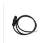
Cable with connector Ca. 2 m., Con 2 poles LKITA00000000040 Ca. 2 m., Con 3 poles LKITA00000000041