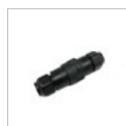
Fast connector IP 2 poles LKITA00000000017