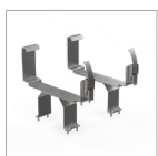
Connection kit for slotted cable trays 200 mm LKITA00000000008