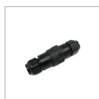
Fast connector IP 2 poles LKITA00000000017