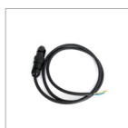
Cable with connector Ca. 2 m., Con 2 poles LKITA00000000040 Ca. 2 m., Con 3 poles LKITA00000000041