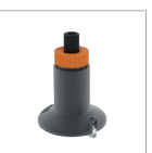
Laser pointer support kit LKITA00000000093