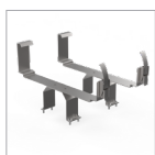
Connection kit for slotted cable trays 300 mm LKITA00000000009