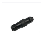
Fast connector IP 3 poles LKITA00000000003