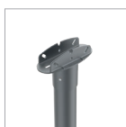
Pole connection B LKITA00000040109