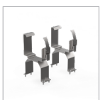
Connection kit for slotted cable trays 100 mm LKITA00000000007