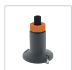
Laser pointer support kit LKITA00000000093