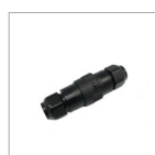
Fast connector IP 2 poles LKITA00000000017