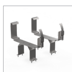
Connection kit for slotted cable trays 200 mm LKITA00000000008