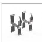
Connection kit for slotted cable trays 100 mm LKITA00000000007