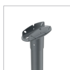
Pole connection B LKITA00000040109