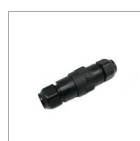
Fast connector IP 3 poles LKITA00000000003