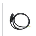
Cable with connector Ca. 2 m., Con 2 poles LKITA00000000040 Ca. 2 m., Con 3 poles LKITA00000000041