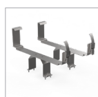
Connection kit for slotted cable trays 300 mm LKITA00000000009