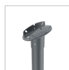
Pole connection B LKITA00000040109