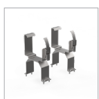
Connection kit for slotted cable trays 100 mm LKITA00000000007