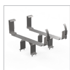
Connection kit for slotted cable trays 300 mm LKITA00000000009