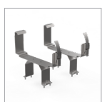
Connection kit for slotted cable trays 200 mm LKITA00000000008