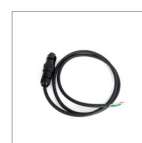
Cable with connector Ca. 2 m., Con 2 poles LKITA00000000040 Ca. 2 m., Con 3 poles LKITA00000000041