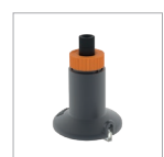
Laser pointer support kit LKITA00000000093