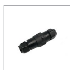
Fast connector IP 2 poles LKITA00000000017