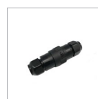
Fast connector IP 3 poles LKITA00000000003