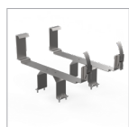
Connection kit for slotted cable trays 300 mm LKITA00000000009