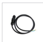
Cable with connector Ca. 2 m., Con 2 poles LKITA00000000040 Ca. 2 m., Con 3 poles LKITA00000000041