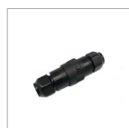
Fast connector IP 2 poles LKITA00000000017