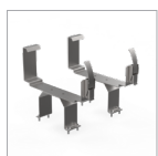
Connection kit for slotted cable trays 200 mm LKITA00000000008