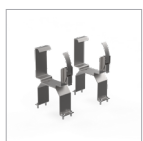
Connection kit for slotted cable trays 100 mm LKITA00000000007