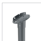
Pole connection B LKITA00000040109