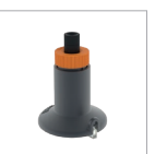
Laser pointer support kit LKITA00000000093