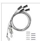
Suspension kit LKITA000000000188