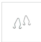
Suspension kit LKITA00000000085