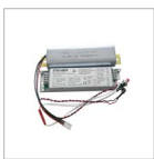
Emergency kit LKITA00000000083