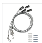
Suspension kit LKITA00000000188