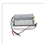
Emergency kit LKITA00000000083