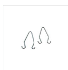
Suspension hooks LKITA00000000085