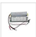
Emergency kit LKITA00000000083