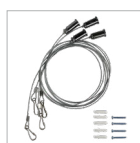
Suspension kit LKITA000000000188