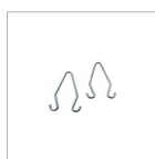
Suspension hooks LKITA000000000085