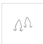
Suspension kit LKITA00000000085