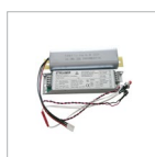
Emergency kit LKITA000000000083