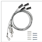
Suspension kit LKITA00000000188