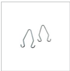
Suspension hooks LKITA00000000085