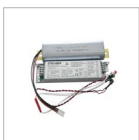
Emergency kit LKITA00000000083