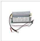
Emergency kit LKITA00000000083