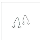
Suspension kit LKITA00000000085