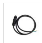
Cable with connector Ca. 2 m., Con 2 poles LKITA00000000040 Ca. 2 m., Con 3 poles LKITA00000000041