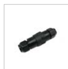
Fast connector IP 2 poles LKITA00000000017