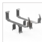
Connection kit for slotted cable trays 300 mm LKITA00000000012