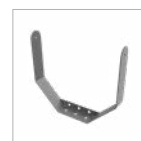
Planar bracket Kit Galvanized iron LKITA00000000043 Inox LKITA00000000044