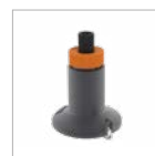
Laser pointer support kit LKITA00000000093