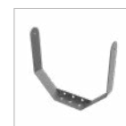
Planar bracket Kit Galvanized iron LKITA00000000043