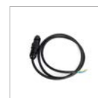
Cable with connector Ca. 2 m., Con 2 poles LKITA00000000040