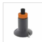
Laser pointer support kit LKITA00000000093