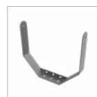
Planar bracket Kit Galvanized iron LKITA00000000043 Inox LKITA00000000044