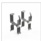
Connection kit for slotted cable trays 100 mm LKITA00000000010