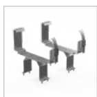
Connection kit for slotted cable trays 200 mm LKITA00000000011