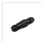
Fast connector IP 2 poles LKITA00000000017