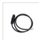
Cable with connector Ca. 2 m., Con 2 poles LKITA00000000040 Ca. 2 m., Con 3 poles LKITA00000000041