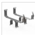
Connection kit for slotted cable trays 300 mm LKITA00000000012