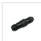
Fast connector IP 3 poles LKITA00000000003